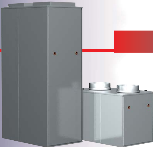
MODELS 6500, 8500, 10000